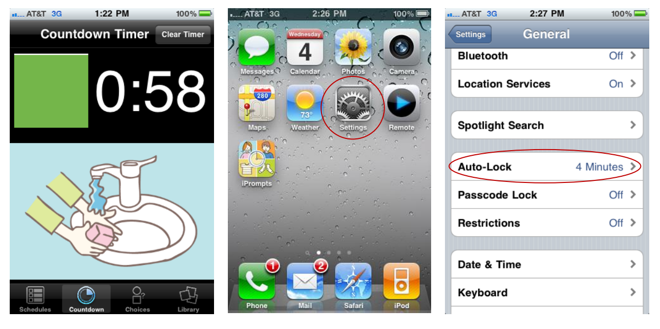
"Wash your hands for one full minute, please."

In the example above, the timer is used to indicate that a certain amount of time remains before the next pictured activity begins. Alternatively, the timer may be used to help an individual stay on a current task for a period of time (e.g., wash hands for one minute, as shown below). When presenting the timer in this manner, it may be helpful to set your iPhone, iPod Touch or iPad such that the screen does not automatically turn off before the timer concludes. Steps for setting the "Auto-Lock" timer on your device are shown below.